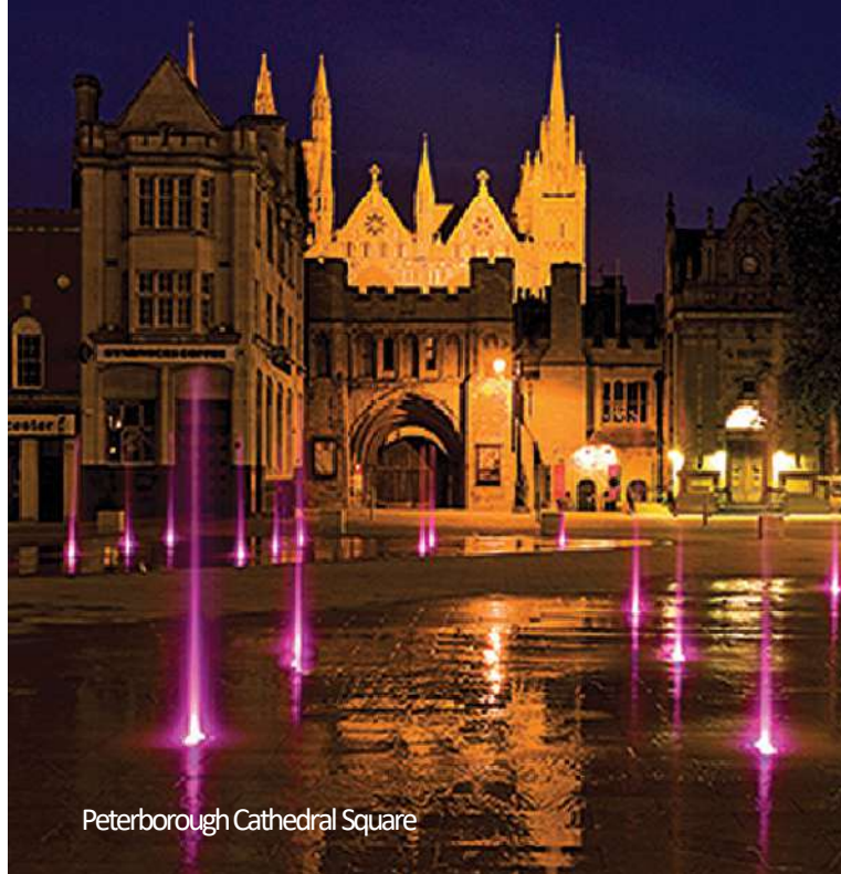
Peterborough Cathedral Square

Anglia Ruskin University (ARU) Guild House, Swain Court, Oundle Road, Peterborough PE2 9PW