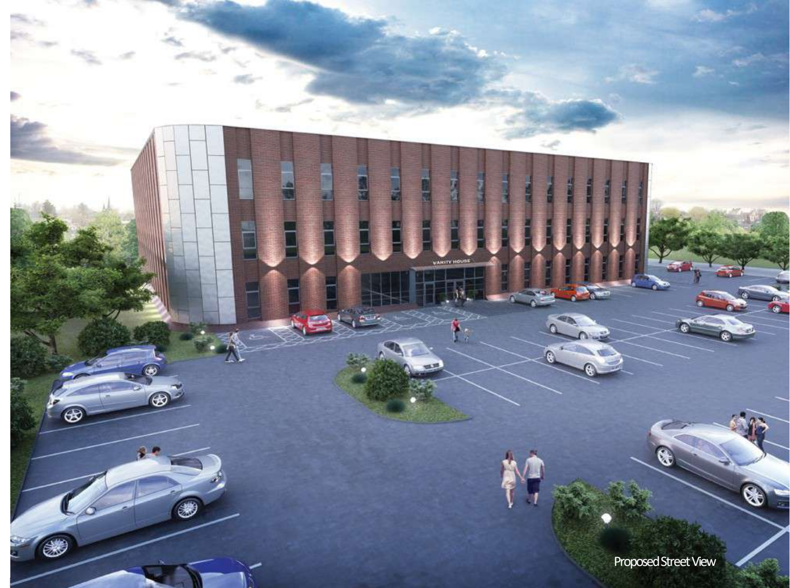
Proposed Street View

Ideal World TV Tesco Distribution Centre